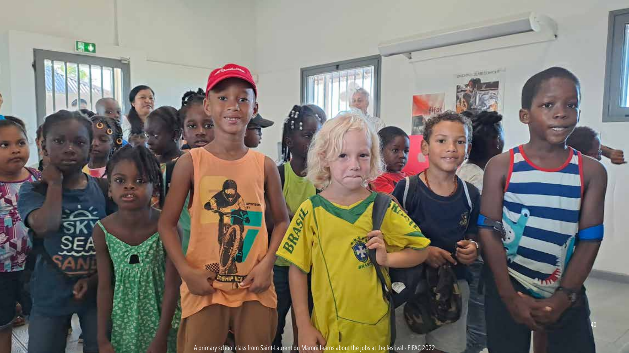
A primary school class from Saint-Laurent du Maroni learns about the jobs at the festival - FIFAC 2022